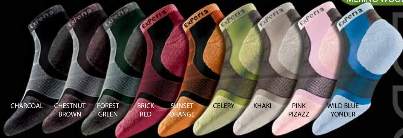
CHARCOAL CHESTNUT BROWN FOREST GREEN BRICK RED SUNSET ORANGE CELERY KHAKI PINK PIZAZZ WILD BLUE YONDER