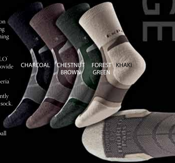
CHARCOAL CHESTNUT BROWN FOREST GREEN KHAKI

Mesh Polyester for maximum breathability. Ultra lightweight sock frame. Nylon covered Lycra® provides contoured aerodynamic glove-like fit. Lightweight Achilles Tendon Pad protects against rubbing and chafing, while functioning as a heel lock. Specially sculpted THORLO® pads in the ball and heel provide protection from shear and impact where needed. Experia eliminates all but the most essential padding, significantly reducing the weight of the sock. Thorlos special blend of Merino Wool/Silk strategically placed in the ball and heel.